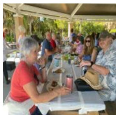
Friends are having a good time all over.