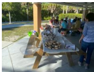
The desserts are ready.