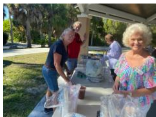
The setup is underway.