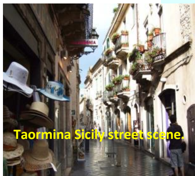
Taormina Sicily street scene.