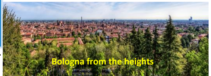
Bologna from the heights