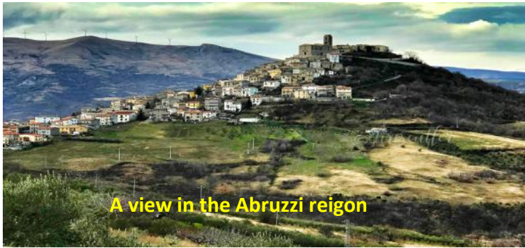
A view in the Abruzzi region