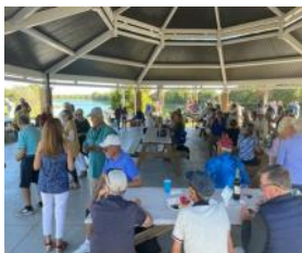
The crowd arrives.